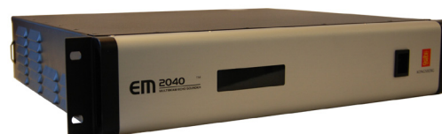
Processing Unit (PU)