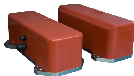
Transducer array (Rx/Tx)