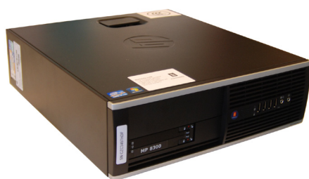
Hydrographic Work Station (HWS)